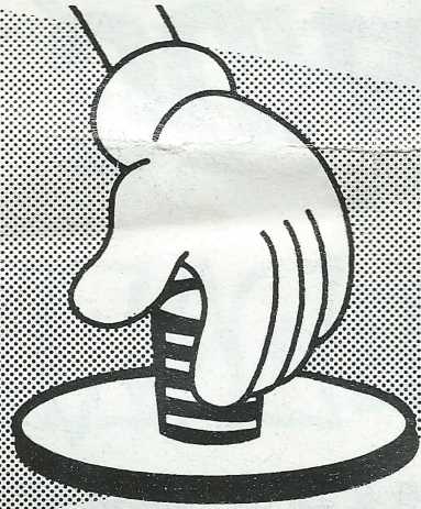
1. STACK 'EM™