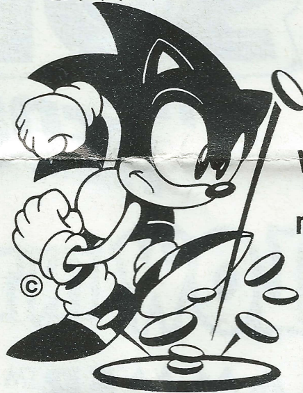
2. SLAM 'EM™